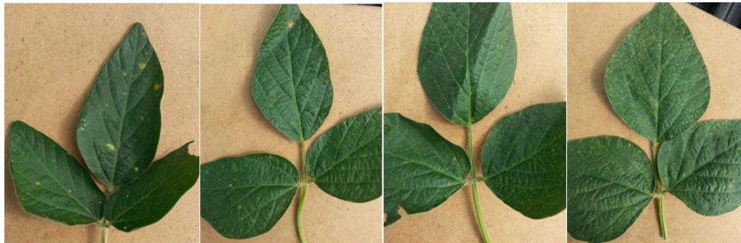
Image 1. Foliar disease infection scale increasing from 1 (left) to 4 (right). Rating of 5 not observed.

Yield data and stand characteristics were analyzed using mixed model analysis using the mixed procedure of SAS (SAS Institute, 1999). Replications within trials were treated as random effects, and hybrids were treated as fixed. Hybrid mean comparisons were made using the Least Significant Difference (LSD) procedure when the F-test was considered significant ( p < 0.10 ). Variations in yield and quality can occur because of variations in genetics, soil, weather, and other growing conditions. Statistical analysis makes it possible to determine whether a difference among hybrids is real or whether it might have occurred due to other variations in the field. At the bottom of each table a LSD value is presented for each variable (i.e. yield). Least Significant Differences (LSDs) at the 0.10 level of significance are shown. Where the difference between two hybrids within a column is equal to or greater than the LSD value at the bottom of the column, you can be sure that for 9 out of 10 times, there is a real difference between the two hybrids. In this example, hybrid C is significantly different from hybrid A but not from hybrid B. The difference between C and B is equal to 1.5, which is less than the LSD value of